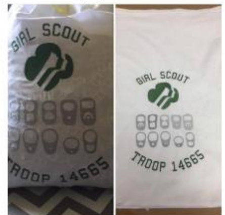
Packed and ready to go!